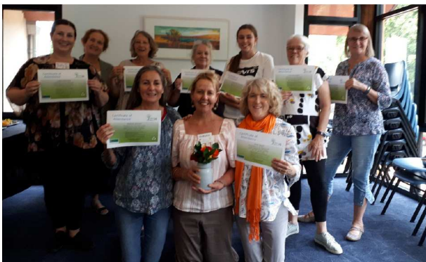
New Eden Associates-Eden Open February - Perth WA

Congratulations to the ongoing commitment of both Enliven PSC and Knox Home and Hospital in New Zealand Their teams report amazing results of ongoing and permanent change across their communities as a result of the Eden Alternative model of person directed care.