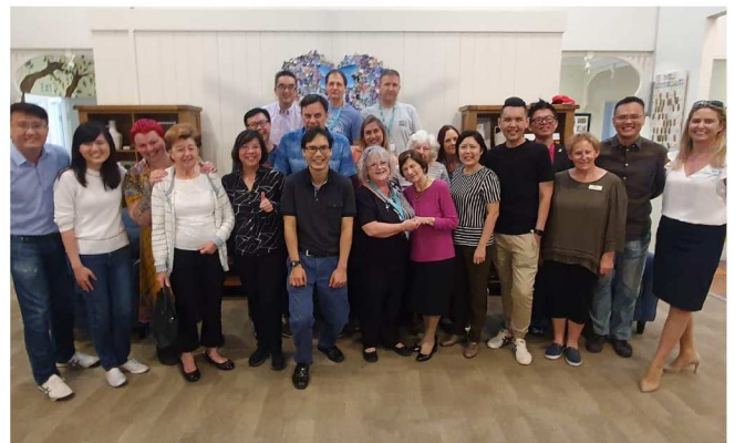
Delegates from SLEC, Singapore, visited both Rosemary House and Cedar House operated by Dementia Australia on the Gold Coast before they attended the conference. They also visited Parkview, Cooper House and St Marks Homes in Geebung.