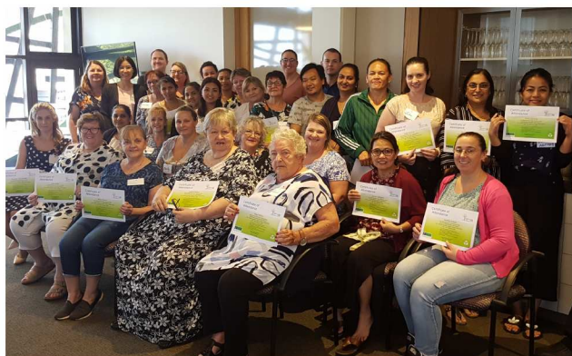
New Eden Associates - Eden Open February, Brisbane QLD