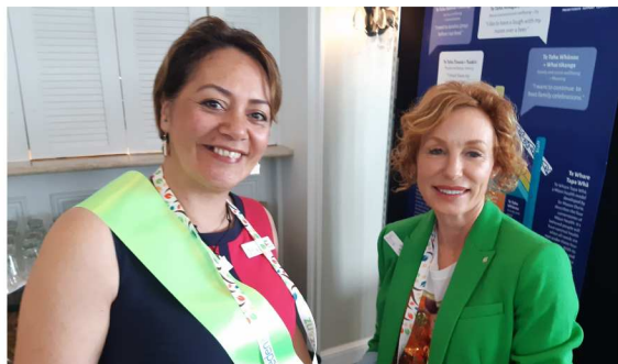
Eden Angels and Room Co-ordinators