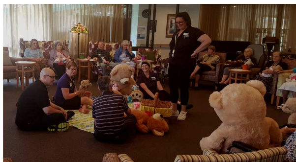
The day's main event - a Teddy Bears Picnic