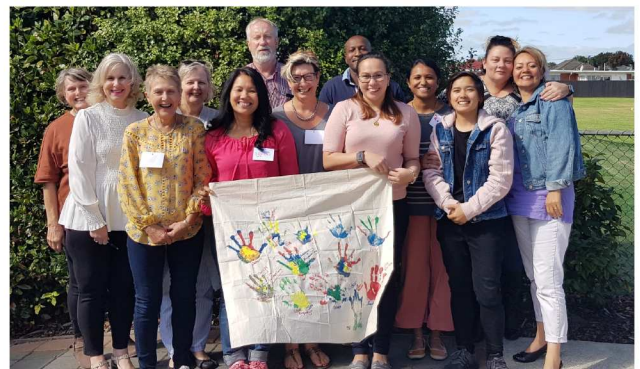
New Eden Associates-Rannerdale War Veterans, Christchurch, NZ