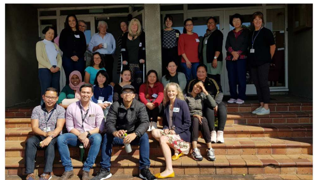
New Eden Associates-Knox Home, Auckland NZ