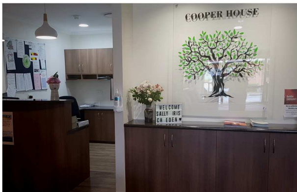
WMQ - Cooper House Foyer

Their services embrace the community of people living with dementia. Ella's house in Mandurah were successful in achieving recognition in Principles 3,4,5 & 6. They all continue to stretch the perceptions of ablement for those living with dementia.