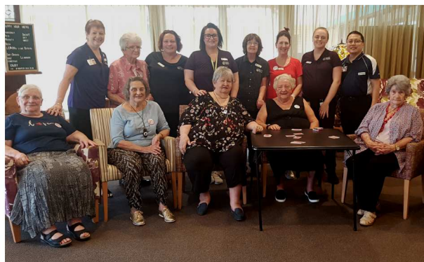
Eden Registry Success at Cooper House

Congratulations to Wesley Mission's Cooper House in Geebung Queensland for their successful review of Eden Principles 9 and 1 which makes them a fully registered Eden home.