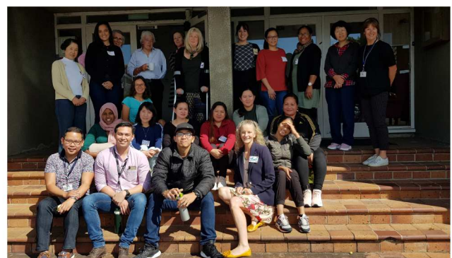
New Eden Associates-Knox Home, Auckland NZ