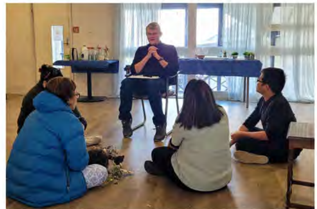
Direct from NZ - the story of Calebs Basket...from HBH In House education - September 2022