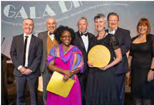
Congratulations to the PSC Enliven Central team for their major success at this conference.

They also received an award for their "Garden to Plate" initiative at Cashmere Home. This project sees residents involved in making food right from growing the vegetables through to the cooking itself.