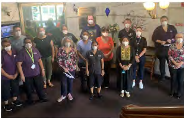
Above: Team Bethesda on their successful Registry visit in April 2022.