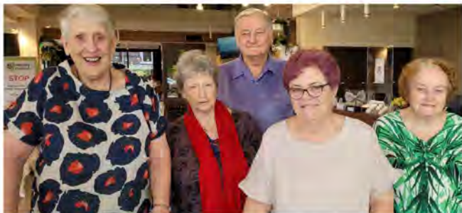
Below: Resident Ambassador welcome committee members