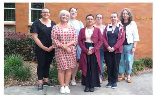
Australia - Eden Associates at the September 2022 Open.