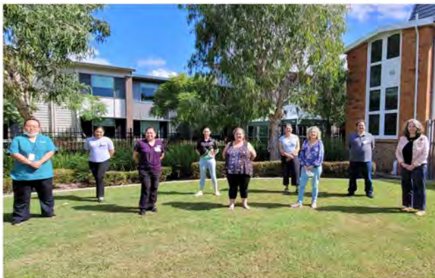
Eden Associates at the April 2022 Open.