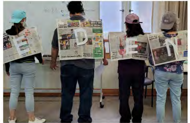
We love the creativity of teams when they attend Eden Associate education. This group from the Eden Open in April 2022 certainly showed us their creative side.