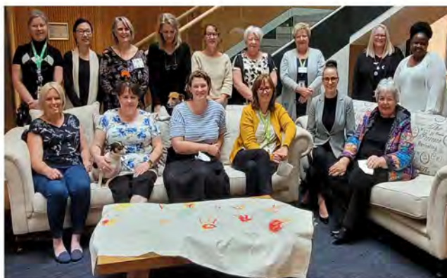
MiCare - Eden Associates, March 2022