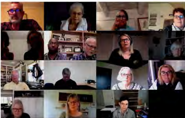
Some of the EARC's and Eden Home Office staff at our bi-monthly virtual meetings.